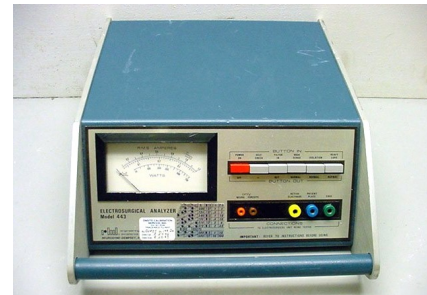
DEMPSEY 443 ANALYZER

Connect analyzer to ESU using a banana plug test leads. Before activating the unit, check that the up and down buttons can control each display between 0 (---) and 50 without noticeable contact bounce.